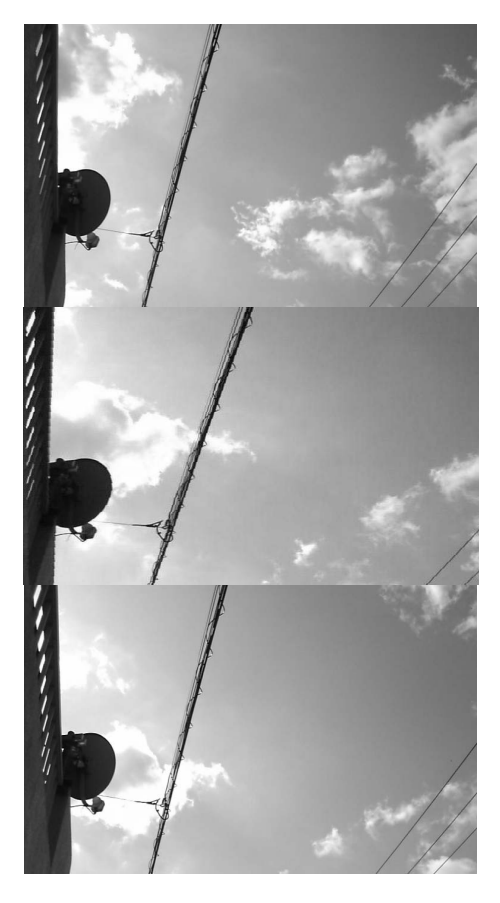
Fig. 6 Change of clouds

The classroom experiment to lower the atmospheric pressure and condense vapour into water to demonstrate the generation of the cloud is well known. But it is easier to understand how the cloud changes in the sky with photographs taken every 30 seconds by using a fixed point camera than any classroom experiment.