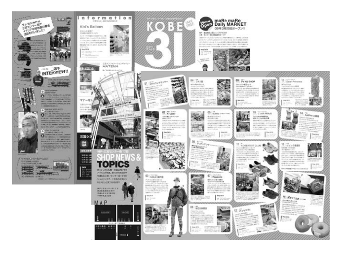
Fig. 1 A leaflet sample

students in SC to take the photographs according to the concepts, then the students in SC react (take photographs) on the request accordingly and post the photographs. Once again the editors discuss the efficiency of the photographs and request changes if needed. The photographs will be finalized with frequent communication between the students in SC and the editors.