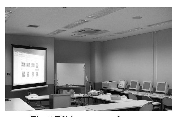
Fig. 5 Editing room and screen