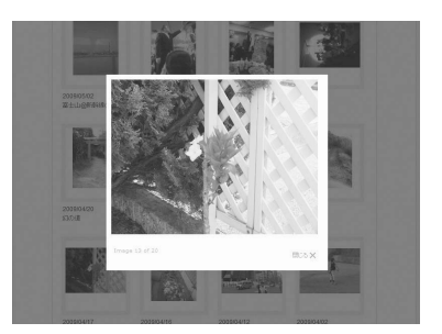
Fig. 4 Posted image

The editing room is in Fig.5. In the room, the administrator and the editors discuss the credibility of the photographs and give instructions to the students in various locations.